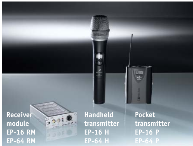
Receiver module EP-16 RM EP-64 RM Handheld transmitter EP-16 H EP-64 H Pocket transmitter EP-16 P EP-64 P